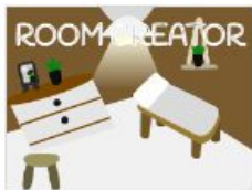
::~Room Creator::~ Scratchdragon352