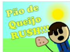
Pão de Queijo Ru... thos1136