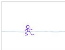
Landscape Painte... Bubblebomb