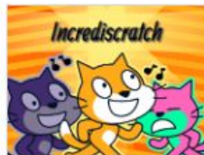
Incrediscratch V3 ScribbleToons